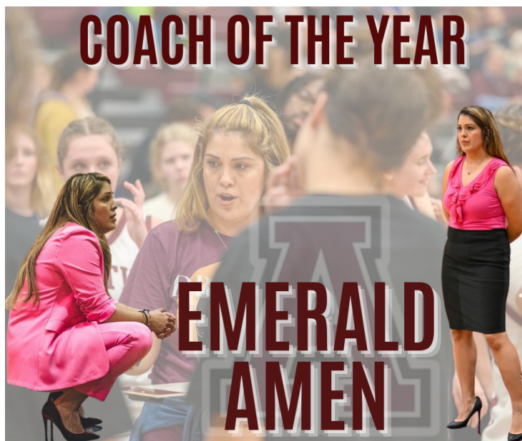
Coach of the Year (3 years in a row)