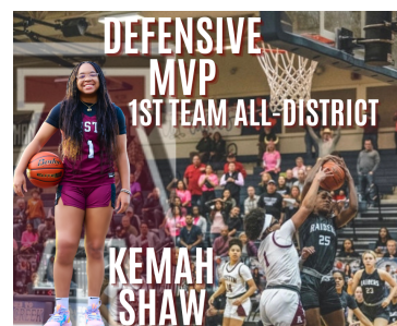
Clack - District MVP (2 years in row)